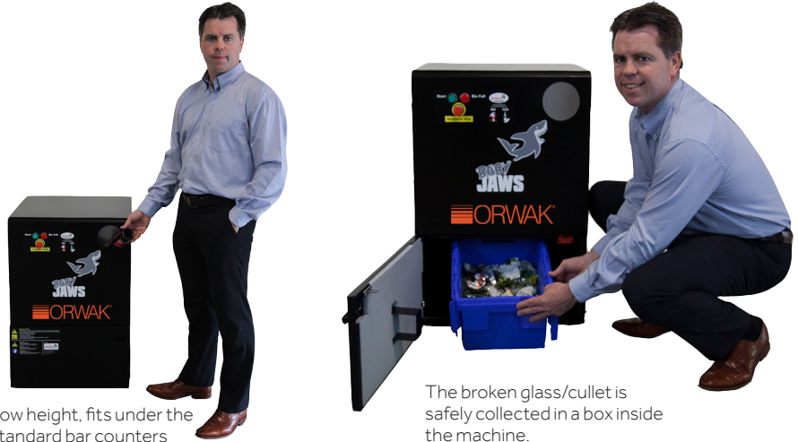
Low height, fits under the standard bar counters

It dramatically reduces the labor cost associated with managing waste bottles, the frequency of glass collections required and the overall waste glass disposal costs for your business.